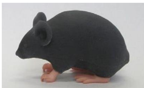
Mimicky® Mouse Body