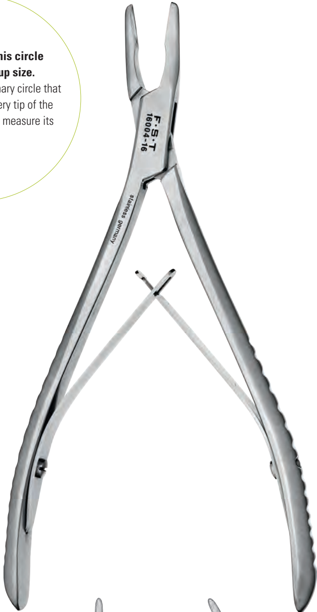
Straight 16 cm Cup size: 2.5 mm No. 16004-16