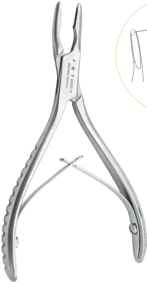
Curved 13 cm Cup size: 2.5 mm No. 16000-14