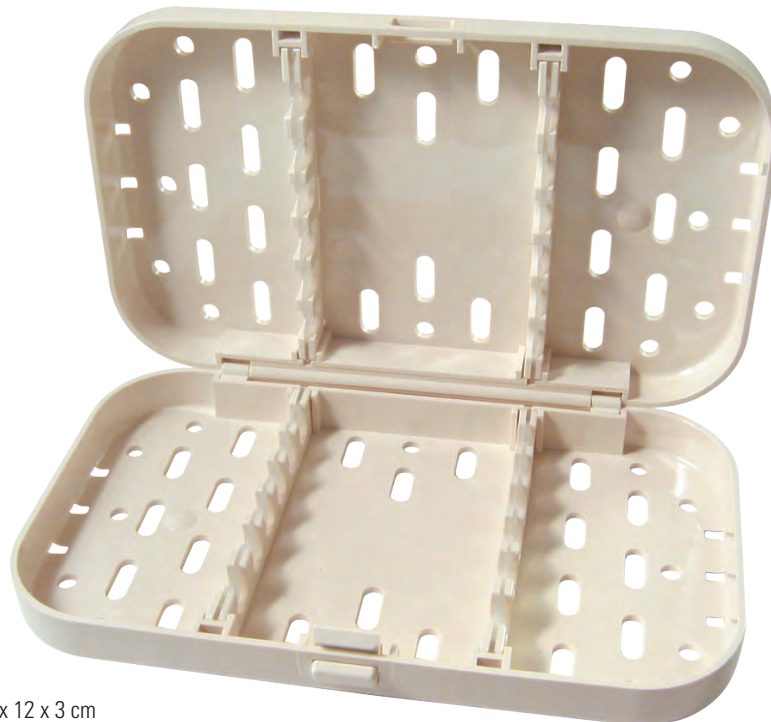
25 x 12 x 3 cm No. 20820-00

This plastic sterilization container has two tiers of silicone slots that will accommodate up to 12 different instruments. Hinged top and bottom lock tight. Container is perforated. Suitable for autoclave or ethylene oxide sterilization.