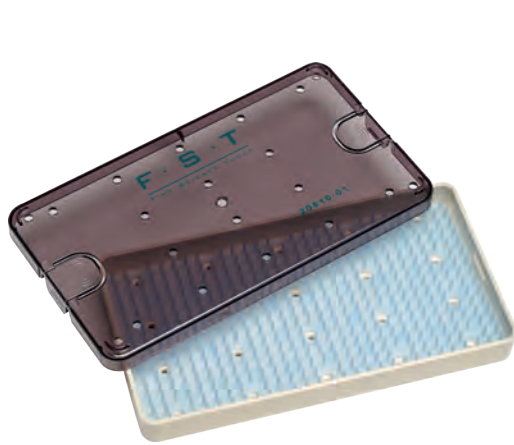
19 x 10 x 2 cm No. 20810-01

This plastic sterilization container includes a silicone mat for safe placement of instruments. Perforated top is clear for visual identification of instruments. Suitable for autoclave or ethylene oxide sterilization.