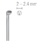
Straight 1x2 Teeth