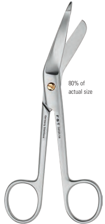
80% of actual size