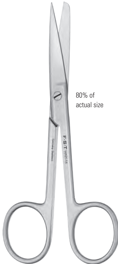
80% of actual size