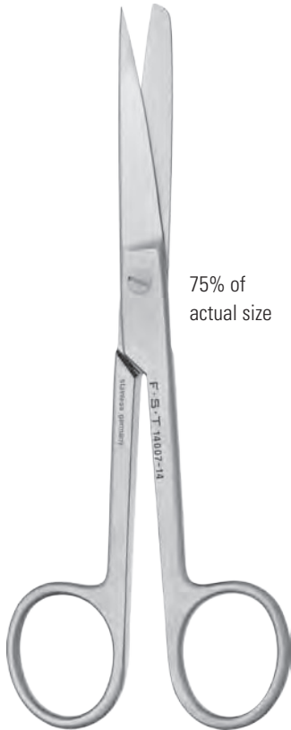
75% of actual size