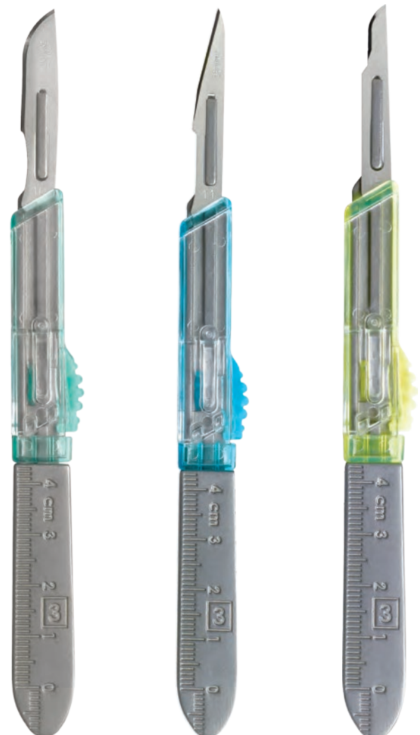
#10 blades #11 blades #15 blades Pkg. of 10 blades Pkg. of 10 blades Pkg. of 10 blades No. 10010-10 No. 10011-10 No. 10015-10

Safety Scalpel Blade Cartridges shown open and attached to handle. Handle and cartridges sold separately.