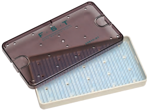
19 x 10 x 2 cm