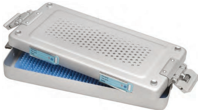
30 x 14 x 4 cm

Suitable for autoclave or ethylene oxide sterilization.